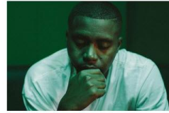
Nas In His Own Words

White was deemed beautiful in the Eighteenth Century by Johann Joachim Winckelmann , the father of European art history, and a guy with a fetish for the Mediterranean facial features of white marble Roman sculptures. Black, meanwhile, became the natural antithesis of beauty. White was given a scientific name and a historical lineage in 1795 when another Johann (Friedrich Blumenbach) called it 'Caucasian'. Black was denominated 'Negro' (literally: black), unworthy of either history or lineage. White was made superior by the Eighteenth Century anthropologists who collected human skulls and made charts comparing facial angles and features, with African skulls placed on one side, near the monkeys, and European skulls safely on the other.