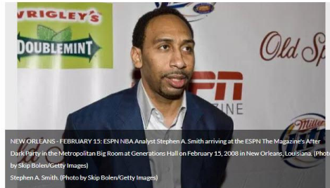
NEW ORLEANS - FEBRUARY 15: ESPN NBA Analyst Stephen A. Smith arriving at the ESPN The Magazine's After Dark Party in the Metropolitan Big Room at Generations Hall on February 15, 2008 in New Orleans, Louisiana. (Photo by Skip Bolen/Getty Images) Stephen A. Smith (Photo by Skip Bolen/Getty Images)