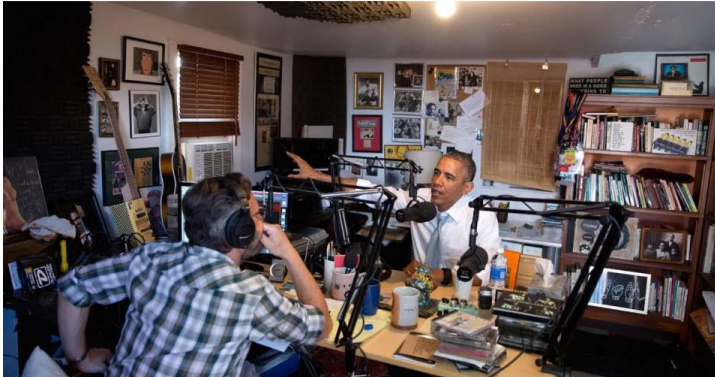
President Barack Obama participates in a podcast with Marc Maron in Los Angeles, Calif., June 19, 2015.